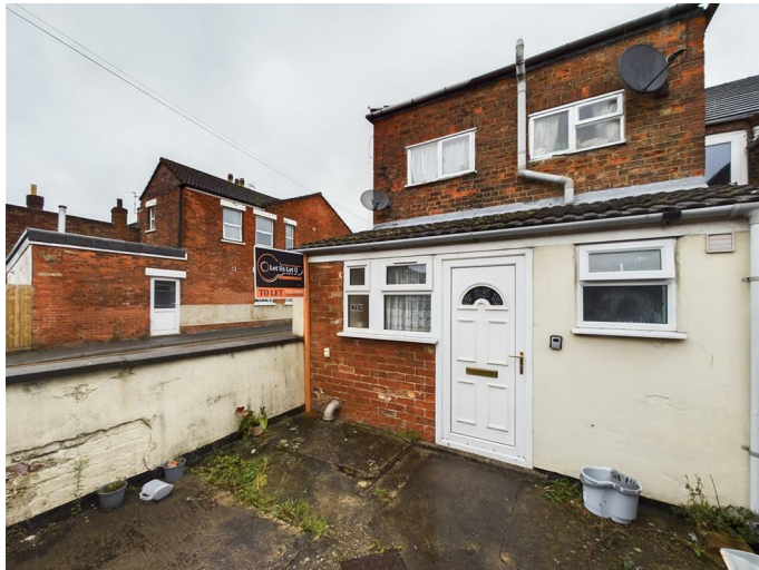
Ground Floor, 25 Trinity Street, Boston, PE21 8RJ